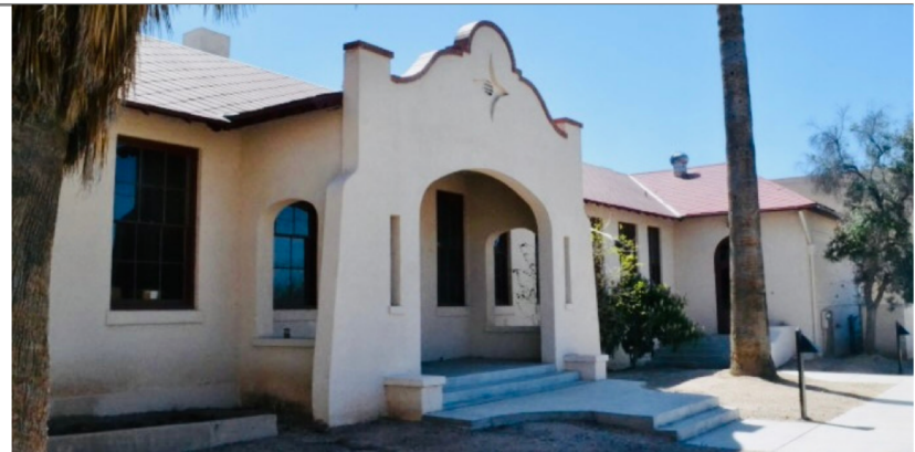
Historic Dunbar School, Tucson 2021 ARIZONA STATE PARKS HERITAGE FUND RECIPIENT